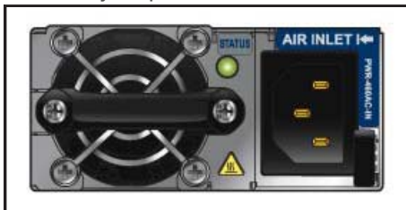
Figure 4-1: AC Power Supply

The power supplies require power cables that comply with IEC-320 and have a C13 plug. The accessory kit provides two IEC-320 C13 to C14 power cables, each two meters long.